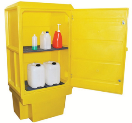
HazardLok ChemLok CP4