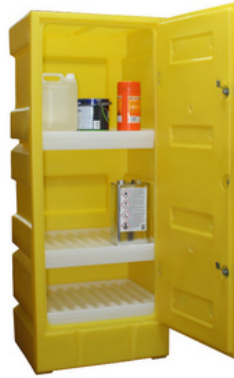
HazardLok ChemLok CP2