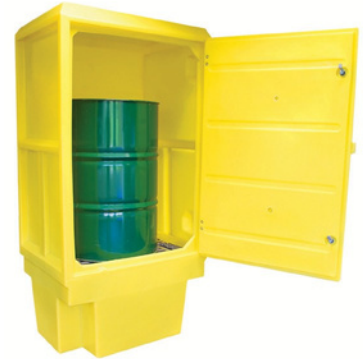
HazardLok ChemLok CP3