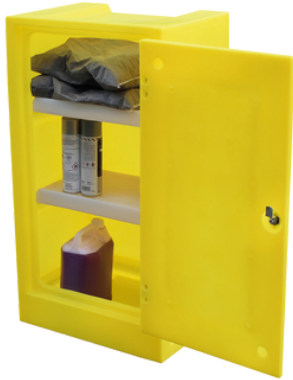
HazardLok ChemLok CP1